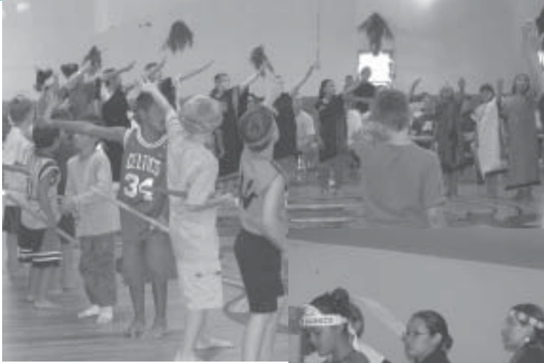
Makah youth dancing