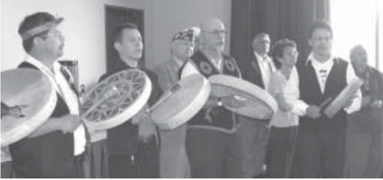
Makah songs to start the July 2004 QBM in a good way