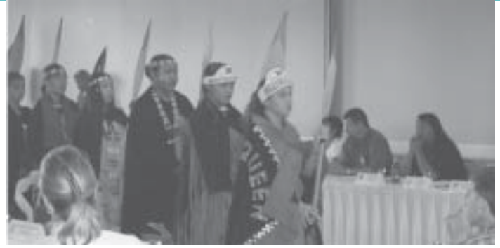
Makah dancers welcoming the July 2004 QBM Delegates and participants