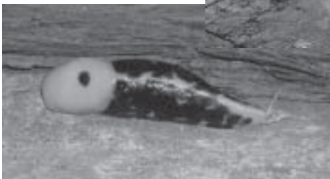
Slug on Cape Flattery