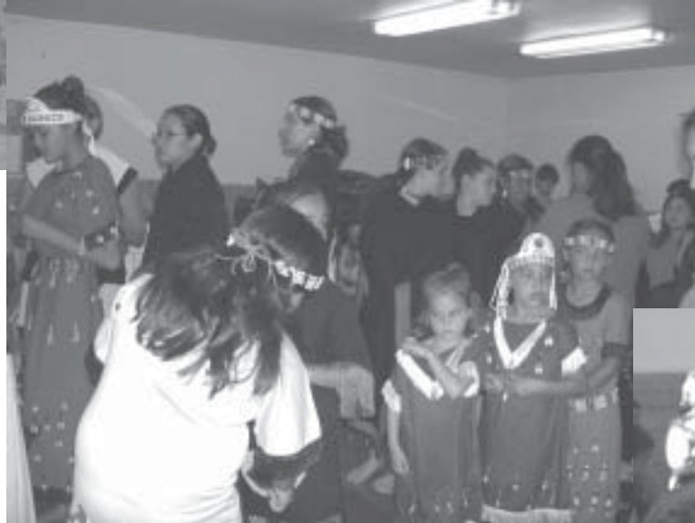
Makah girls preparing for a dance