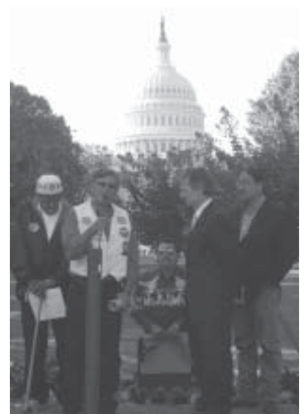
Navajo Code Talker presenting Senator Daschle with a Pendleton blanket