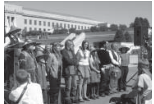
Lummi totem pole carvers