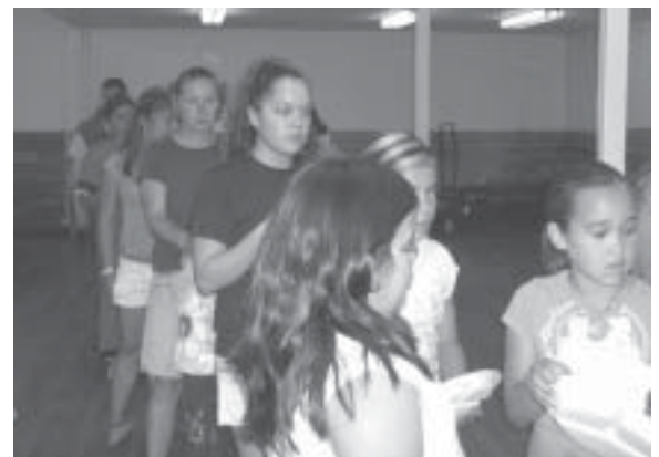
Makah girls delivering dinner plates to guests