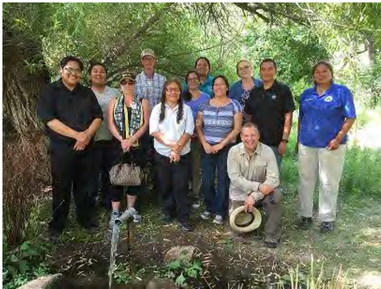
Site Visit San Carlos Apache Tribe

Welcome to the Centers for Disease Control and Prevention’s (CDC) tribal resource digest for the week of September 19, 2016. The purpose of this digest is to help you connect with the tools and resources you may need to do valuable work in your communities.