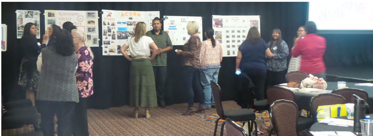
California Rural Indian Health Board Resource Meeting Grantees sharing projects during poster session – April 2017