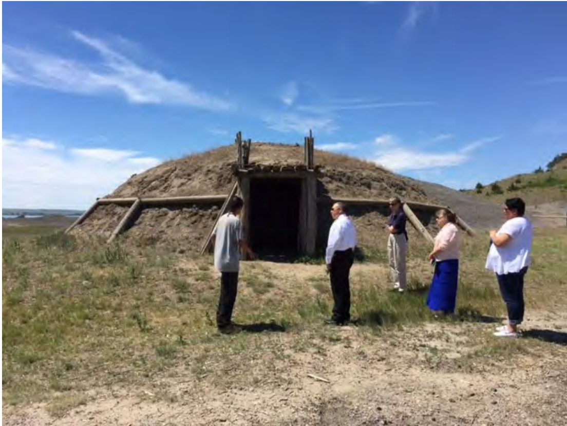
Visiting Lower Brule Sioux Tribe’s Earth Mound

Welcome to Centers for Disease Control and Prevention’s (CDC) tribal resource digest for the week of November 13, 2017. The purpose of this digest is to help you connect with the tools and resources you may need to do valuable work in your communities.