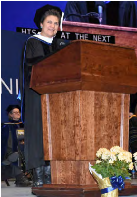
Commencement address Fall 2018