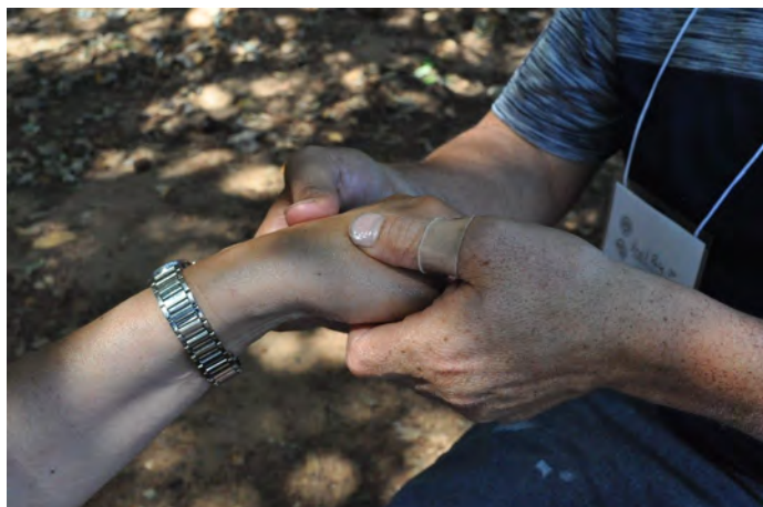
Essential oil hand massages being given during the event.