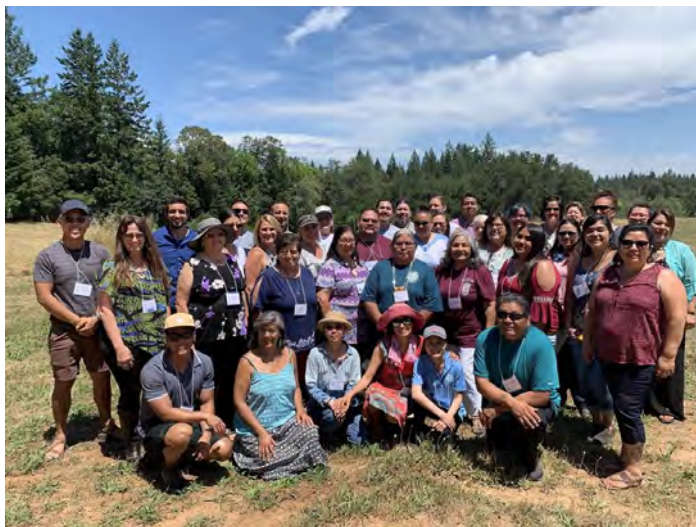
Group photo from the ACORNS/CITE Resource Meeting 2019

Each year, CRIHB hosts an in-person ACORNS/CITE Resource Meeting for their current subawardees. This year, the Resource Meeting was held June 12-13, 2019, at Ya-Ka-Ama Indian Education and Development in Forestville, CA. Representatives from 15 of our 22 grantees and over 40 participants attended the meeting. Participants heard from elders who shared their involvement and commitment to diabetes prevention through their work on a Diabetes Action Council. They heard from youth who are teaching peers in their community about the risks of commercial tobacco and have gotten 12 teenagers to commit to quit smoking. A passionate group of young adults, who created an alliance in their area to support the health of their communities, shared their commitment for nation-to-nation building and cultivating partnerships. Participants were taught how to make essential oil hand scrubs and do a Maori healing massage by community champions who have focused their project work on healing the community healers. A native farmer shared his expertise in organic food production and how to connect that food to the community. Cultural leaders guided participants through a visioning of what a healthy native community looks like.