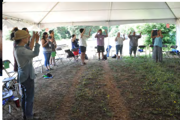
One of our grantees leading a session on RomiRomi Maori healing massage