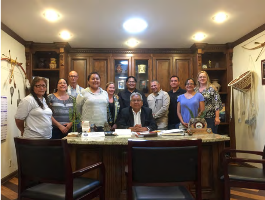
2016 Site Visit to San Carlos Apache Tribe

Welcome to the Centers for Disease Control and Prevention’s (CDC) tribal resource digest for the week of October 3, 2016. The purpose of this digest is to help you connect with the tools and resources you may need to do valuable work in your communities.