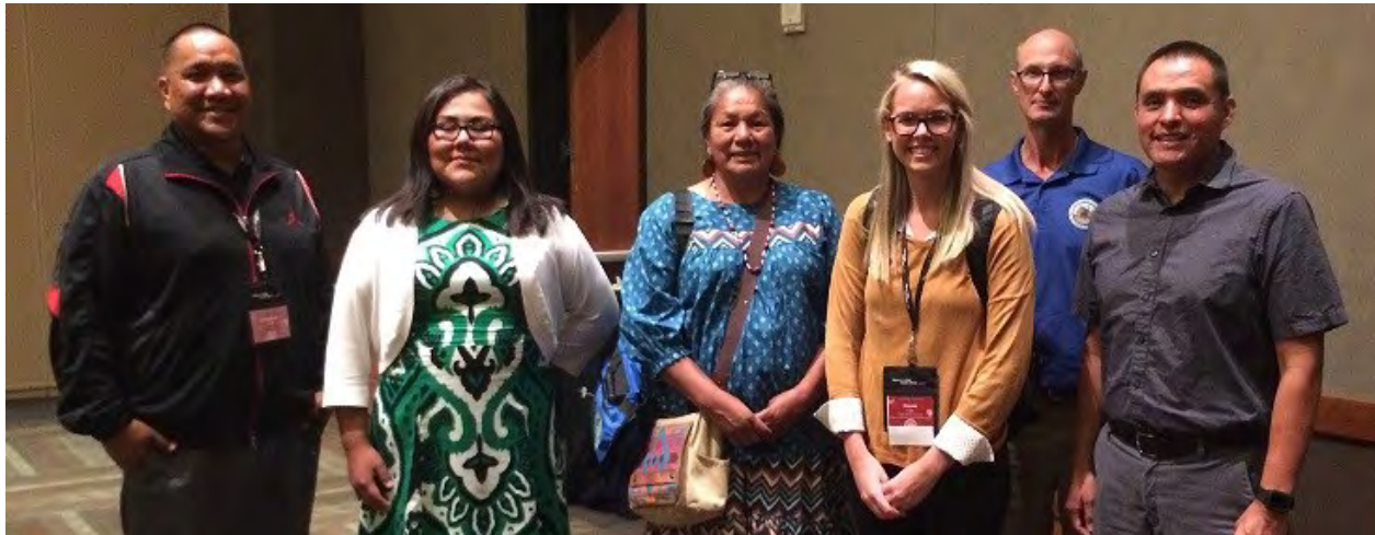
2016 National Indian Health Board Conference

Welcome to the Centers for Disease Control and Prevention’s (CDC) tribal resource digest for the week of September 26, 2016. The purpose of this digest is to help you connect with the tools and resources you may need to do valuable work in your communities.